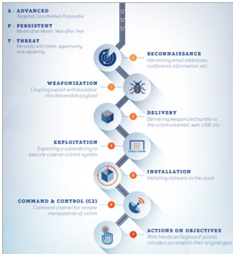
Figure 1 -- Lockheed Martin Cyber Kill Chain courtesy of SANS

A company's brand is a source of value and a target for cyber attackers. The brand represents the trust the company has invested in and developed with its customers. Exploiting trust or "hacking the human" is an essential part of the initial attacker activities. These involve getting the human to do something that might be against their best interests. These activities are represented as the initial steps in a chain of events known as the Cyber Kill Chain 1 (see Figure 1). The first phase of the Cyber Kill Chain, initial reconnaissance, is often problematic for organizations who don't know where to start to collect information about registrations of malicious domains and monitor company email address / plain text password combinations found in the dark web or places such as Pastebin.